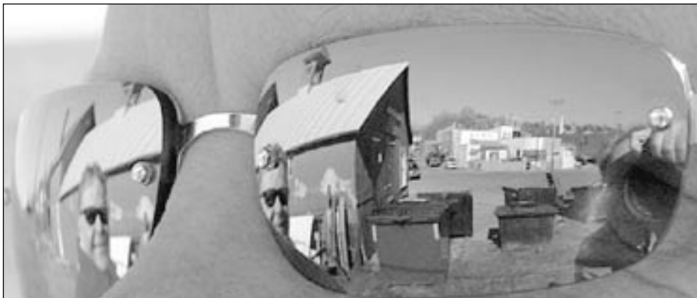
Who is this Galena Rotarian behind the shades?

The Galena Rotary Club has received a letter appreciation from the Jo Daviess County Board of Health. In due course the club will provide the Rotary Foundation with an account of exactly how the grant funds have been used.